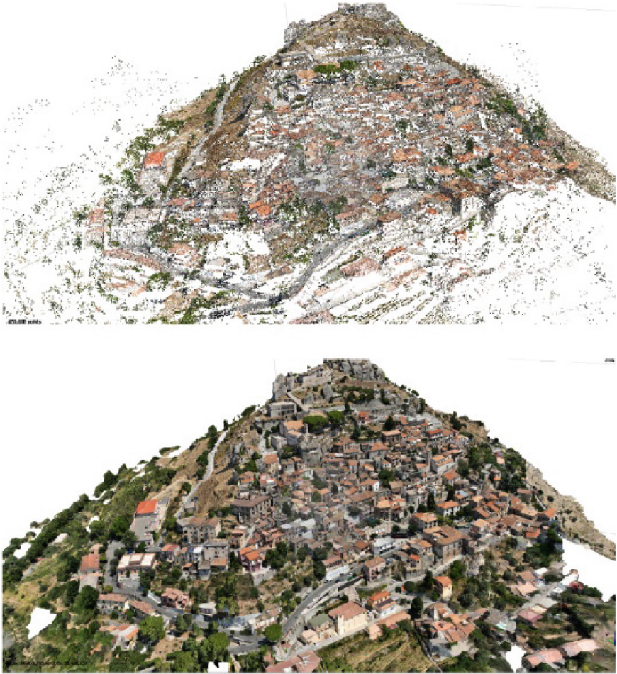
Fig. 2. Comparison between dense point cloud generated by SfM (top image) and 3D mesh model with high-resolution texture mapping (bottom image) of Bova's historic center.

All operations were conducted in Agisoft Metashape standard version 2.2 (2025), a widely adopted platform for architectural and heritage documentation. The output dataset contains a detailed 3D model of the historic area with textures, true-scale orthophotos for flat measurements and a georeferenced points cloud for spatial referencing and additional measurements. These outputs give a complete 3D visual view of Bova's historic center which provides the geometric and visual foundation for all future steps, allowing structural and typological information.