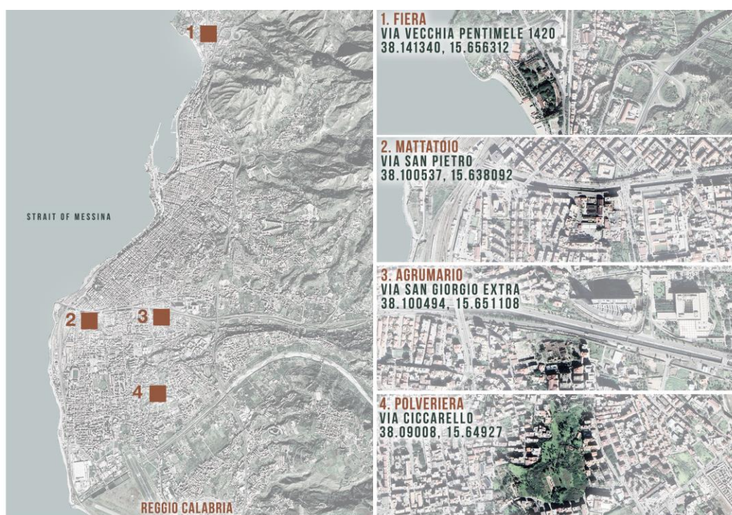
Figure 1. Case studies of industrial heritage in vulnerable contexts. (1. Fiera; 2. Mattatoio; 3. Agrumario; 4. Polveriera).

Furthermore, the enhancement of this heritage could be a driving force for the regeneration of the territory, attracting new visitors and bringing benefits to the local inhabitants in the environmental, economic, and social dimensions.