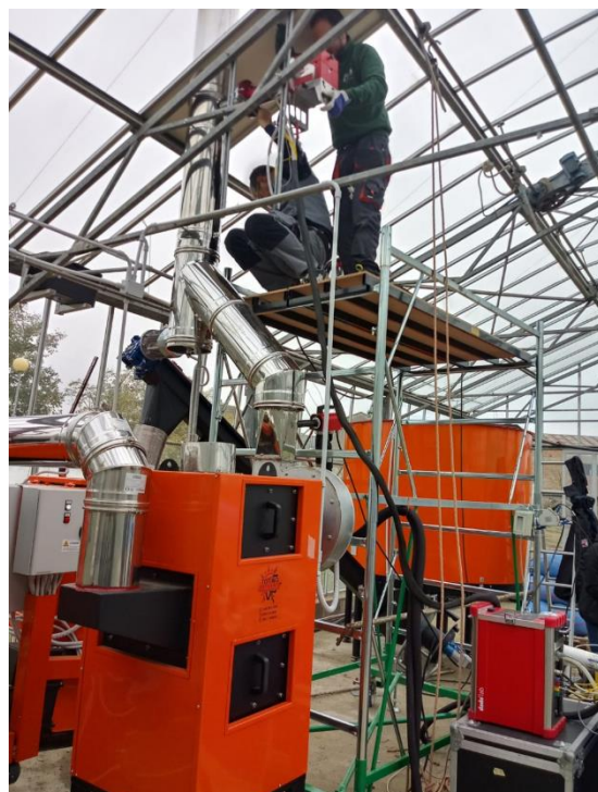
Figure 1. Isokinetic sampling of organic pollutants at the stack.