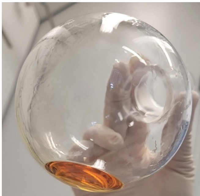
Figure 1. Sample of AnchoisOil following limonene removal.

sustainability profile when compared to toxic (and highly volatile) n -hexane. [30] Limonene, indeed, is both an antioxidant and bactericidal agent, [31] ensuring protection of PUFAs in AnchoisOil during the solvent removal at 90 °C. The peroxidation-prone double bonds of omega-3 lipids are protected from oxidation also by lipophilic polyphenols such as the phlorotannins naturally present in certain fish and seafood species, [32] as well as by the antioxidant coenzyme Q 10 and retinol abundant in anchovy, that are transferred to the AnchoisOil imparting it with a distinct orange color (Figure 1). [26]