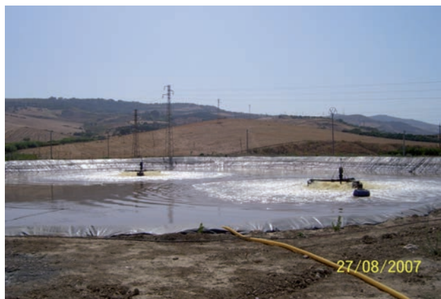
Figure 1. The full-scale aerobic-anaerobic aerated lagoon under investigation.

In the following discussion each tank will be indicated by the symbol "T xx,xx,xx ", where: the first two numbers of the subscript refer to either the position of the air diffuser ("0" for positioning above the tank bottom and "1/2" for placing at mid-depth) or other information about the experimental conditions ("IN" for tank with "inoculum" wastewater and "NA" for the tank not aerated); the intermediate numbers refer to the air flow rate ("7" or "14" L m -3 h -1 ); and the final two numbers refer to the aeration time ("12" or "24" hours). For example "T 1/2,7,12 " indicates the tank with the diffuser placed at mid-depth and subject to