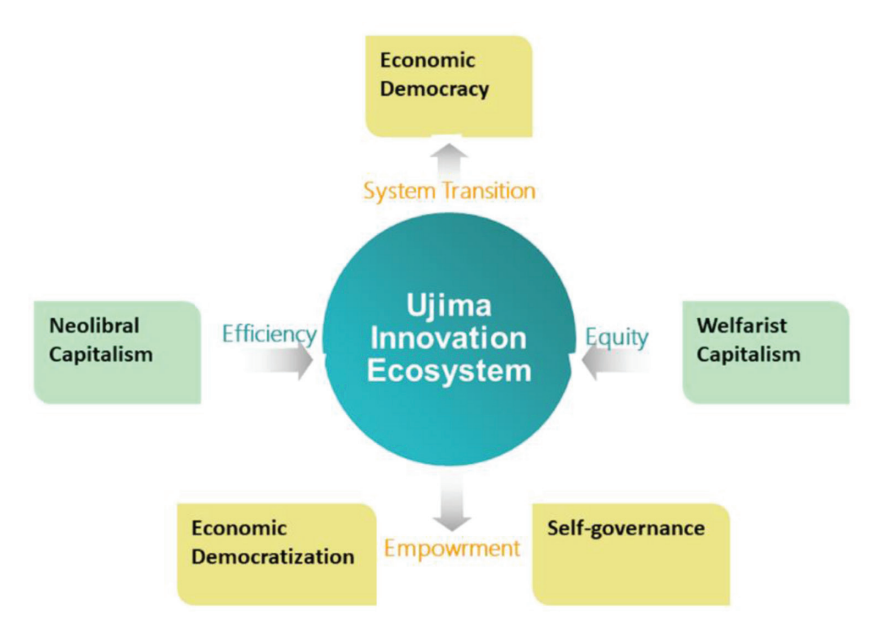
Figure 3: The Ujima Political System based on economic democracy.