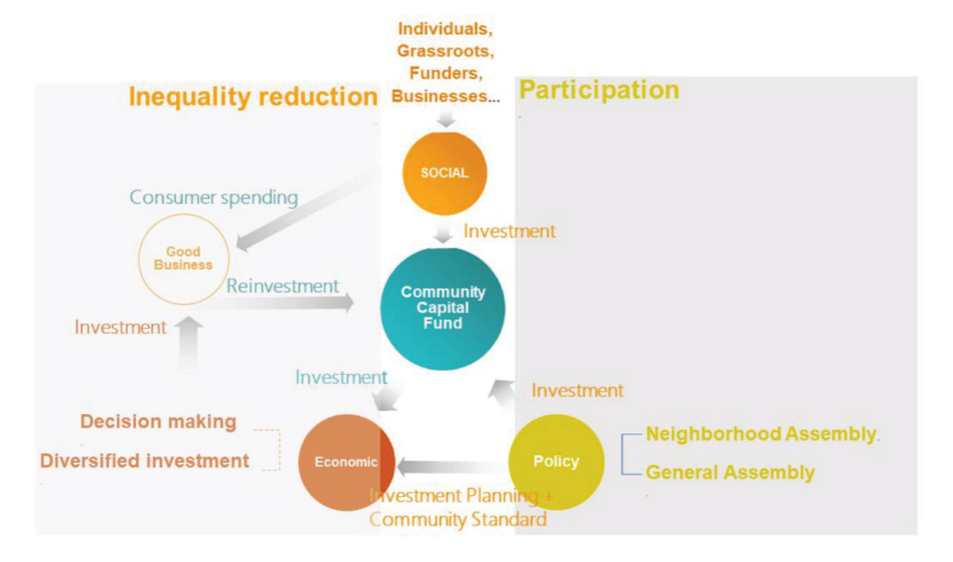
Figure 1: Innovation ecosystem of the Boston Ujima project.

to increase their access to capital. Besides capital investment, community-rooted businesses are also able to apply for free office space and business coaching. This marks a meaningful shift of investment finance away from models of competition and profit towards models of community and support. On the other hand, with a democratized economic decision-making, the BUP is able to allocate democratically its pooled fund based on community needs and common interests instead of individual interests of the investors with more share in the Community Capital Fund (CCF). More importantly, it fosters a solidarity-based cooperative culture within communities and thereby curtails possible conflict of interests. At its 'Boston Solidarity Summit' in 2016 where it tested its CCF for the first time, the BUP allocated through a democratic voting process, at zero loan interest rate, a fund of $20,000 pooled from over 175 small lenders and investors to five Black and immigrant owned businesses. The loans were mainly used to purchase business equipment such as industrial printer, Point of Sale System, etc.