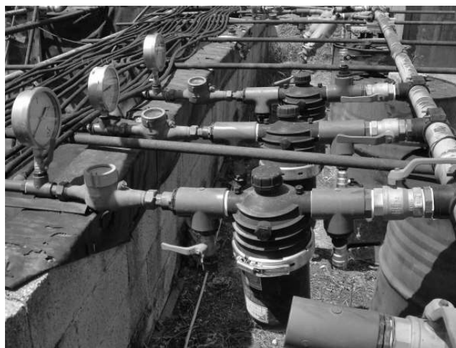
Fig. 1 Experimental irrigation system.

3.8, 7 and 15 l h -1 drippers, respectively.