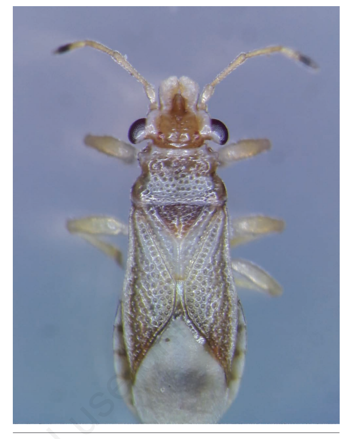
Figure 2. Adult of Thaumastocoris peregrinus.

This is possible thanks to its reception of volatile substances produced by the plants, that are quantitatively and qualitatively different from those produced by already infested trees (Martins and Zarbin, 2013).