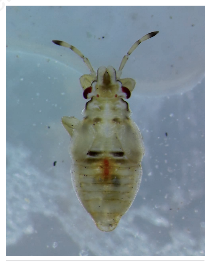
Figure 3. Nymph of Thaumastocoris peregrinus.