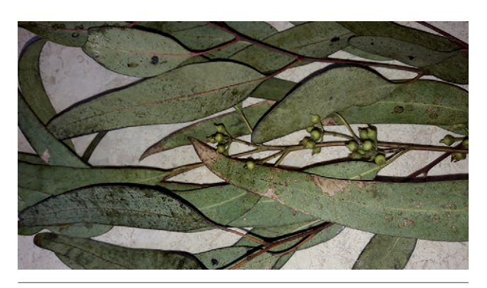
Figure 4. Thaumastocoris peregrinus damage on Eucalyptus leaves.

In order to monitor the evolution of infestations within Eucalyptus planted trees, it is possible to integrate the WorldView-2 satellite data information with the field data, integrated with environmental variables, in order to improve the mapping of the species distribution and the pullulations size in the planted trees (Oumar and Mutanga, 2014).