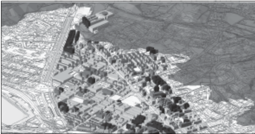
Figure 2. Case Study, Reggio Calabria, Italy. Geometrical modeling of urban spaces. Building scale 3D city model. "Photo-realistic 3D modeling of buildings from field survey". The building prototype: Urban Block #128.