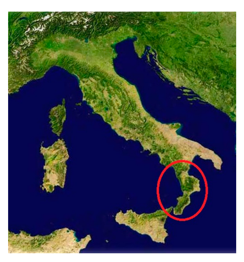
Figure 1. Geographical location of the case study area: Calabria.

As a consequence of the scarce level of economic development and the high level of unemployment, the wealth of the resident population is low, and poverty is a relatively widespread phenomenon [28]. The relative poverty rate in 2017 was about 35%, while in Italy it was 12% and in Southern Italy 25% [29]. Demographic growth is no exception (https://www.tuttitalia.it/calabria/statistiche/ popolazione-andamento-demografico/): From 2013 to 2018, the annual demographic growth was negative (from -0.2% to 0.5%). As Svimez underlined [15], Calabria is one of the Italian regions going through a kind of "human desertification" process.