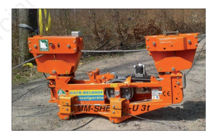
Figure 2. MM-Sherpa U3t Carriage.