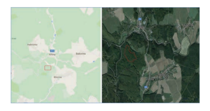
Figure 3. Krtiny Training Forest Enterprise in Brno province and the felling area.