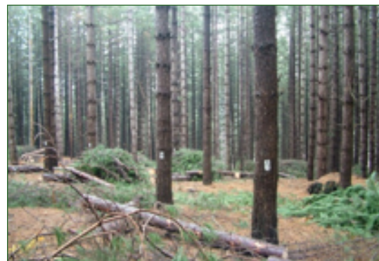
Figure 1 - Study area: site A (left) and site C (right).