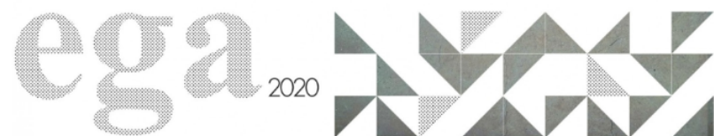
Fig. 1. Cover of conference.

On the first day of the Congress, round tables were held on the first three of