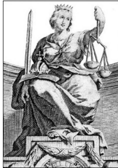
Fig. 1 Detail of the frontispiece calcography signed “G. van der Gouwen sculpsit”, from Vol. I of Corpus juris civilis , Editio nova, Amsterdam: sumptibus Societatis, 1681.

One crucial element is power. A sort of power coming from above, from supernatural: and therefore something which is received and not created, or, nevertheless, something that is not discretionary and requires certain conditions.