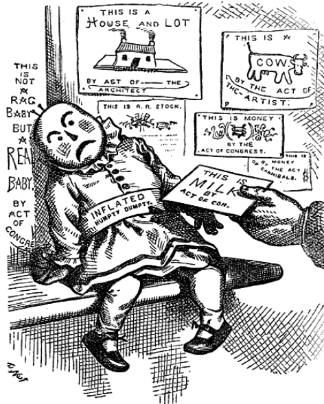
Fig. 8 T. Nast, Stamps for milk to children, instead of milk 1876.

In the end, the parody of justice by Brant, a natural law all consisting of form, with sword and scale, but unable to see, and, instead, fouled by reality and by the perception of reality, is easily associated to another parody, by Nast, which reproduces the ability of inventing reality, beyond the connection to facts, with what simply (and I do not say naturally ) is. In a post-modern fashion and following the thesis “there are no facts, only interpretations” 17 .