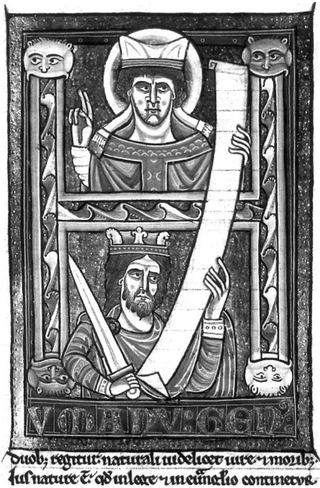
Fig. 4 Spiritual and secular powers invested by statute. Decree of Gratianus with glossa by Barthélémy de Brescia. Image taken from R. Jacob, Images de la justice , plate I.

As this wonderful image shows, God delegates, exactly by giving the two swords, representing the two powers, both to the pope and to the emperor, which are therefore commonly bound by the same decree, the same very text. Another image taken from the Decree of Gratianus.