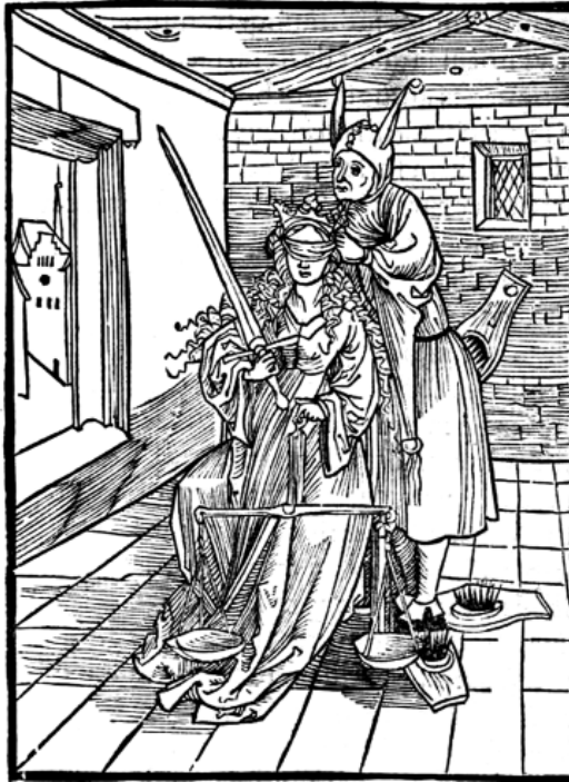
Fig: 7 S. Brant, Xylography taken from The ship of fools , Basel, 1497.

Here, the veiled Justice appears to be actually blind and uselessly formal, made sightless to the real needs by a clown-demon.