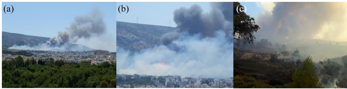
Figure 1. (a) A peri-urban fire on Mt Hymettus, in the outskirts of Athens, on July 17, 2015, with one fatality, (b) a peri-urban fire on Mt Hymettus, in the outskirts of Athens, on July 17, 2015 (detail), and (c) fire in the rural area of Kalamos Attica Greece (summer 2017).

area burned since 1991 was around 447 ha but only 283 ha between 2009 and 2018. Nevertheless, 2018 had the second highest forest area burned since 1991. The average area burned per fire generally around 0.5 ha. The current regional hotspot of wildland fires is in the region of Brandenburg with more than half of the area burned during the largest fires in 2018 (725 ha burnt only in August) and almost three times more than in the dry summer of 2003 when approximately 600 ha of forest has burnt in this federal state. This region is very prone to wildland fires as it has large proportion of connected forest area (44% of the forest is under protection, LFU Brandenburg), which are formed by pine monocultures on sandy soils, a particularly dry and flammable forest type. Since the industrialization, changes in forest management in several regions of former Prussia have replaced some of the previous and less-flammable forest dominated by deciduous trees (Dietze et al., 2019) by pine monocultures. This deep transformation was only possible by strong intervention into the hydrology, for example, building drainage ditches, which now are increasing drought problems, and thus fire susceptibility, in the mid mountain ranges.