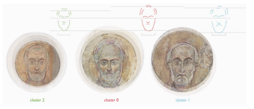
Fig. 5. AI clustering: visualization of the data obtained.