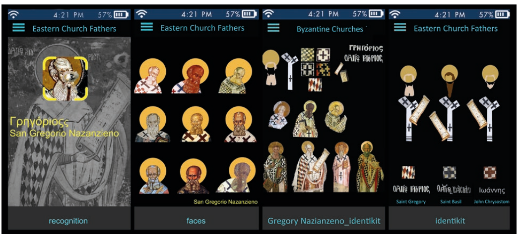
Fig. 2. St. Nicholas of Nazianzen. Identification system based on an iconographic database.

The resulting disuse, paradoxically, preserved them by excluding from continuous adjustments to the changing needs of the cult and society. At the same time, the abandonment, together with numerous deliberate damages of the iconoclastic era, compromised the legibility of the iconographic apparatus. The proposed system guides users into the Byzantine iconographic world, highlighting the elements that help recognize the represented sacred figures. This system can be developed in two different ways: by recognizing faces already presents in a database or by using artificial intelligence to recognize faces and virtually restoring them (fig. 2). In the first mode, the system identifies the representation of the Saint, offering a comparison with other images present in the neighbouring regions and highlighting recurring elements [4]. Moreover, the system underlines the elements that contribute to the identification of the saint himself [Grotowski 2010; Innemée 1992].