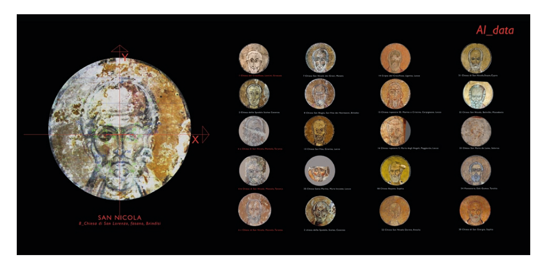
Fig. 3. Al, input data of the reference models.

The case study is the effigy of St. Nicholas of Myra, widespread throughout the south. The effigy of the Saint appears very repetitive and codified. For this reason, this effigy is suitable for an analytical investigation that starts from some preliminary morphological hypotheses.