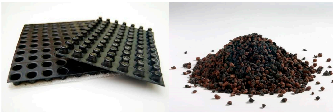
Figure 2. Green roof drainage materials: Modular panels (on the left) and granular materials (on the right).

For granular materials, the requirements are permeability ( i > 0.02 ), compressive strength ( > 1.5 N/mm 2 ), and thermal conductivity ( \lambda < 0.2 W/mK). For modular panels, the required characteristics are vertical draining capacity under operating loads (0.7 l/m 2 s), compressive strength, having longitudinal tensile strength ( > 7.0 kN/m) and tensile strength ( > 7.0 kN/m to be applied only for green roofs with slope > 30\% ), and resistance to aggressive agents. These panels are made with cavities to