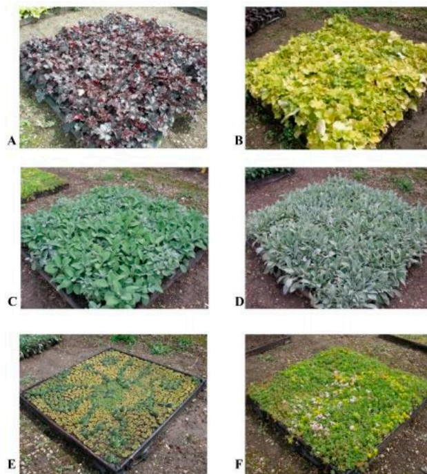
Figure 4. Plants used by Vaz Monteiro et al. [79]: A. Heuchera 'Obsidian'; B. Heuchera 'Electra'; C. Salvia officinalis 'Berggarten'; D. Stachys byzantina ; E. Sempervivum 'Reinhard'; and F. a Sedum mix .

Species mixtures have often been correlated to enhanced aesthetic value. Furthermore, plant variety could improve substrate cooling, prevent intrusive unwanted plants, and preserve water. Heim and Lundholm [77] tested three drought-tolerant, mat-forming species native to Nova Scotia , Cladonia spp. (lichen), Polytrichum commune (acrocarpous moss), and Danthonia spicata (bunchgrass). The results showed that the incorporation of functional diversity, especially varied growth forms, increases the diversity of green roofs, potentially improving the resilience and performance of these systems in the long term. Van Mechelen et al. [78] analyzed the initial plant composition of commercial extensive systems, in terms of functional diversity, and proposed two methods to compose species lists which maximize functional diversity. The authors believed that designing functionally diverse plant systems will support more sustainable urban planning and improve the quality of urban life.