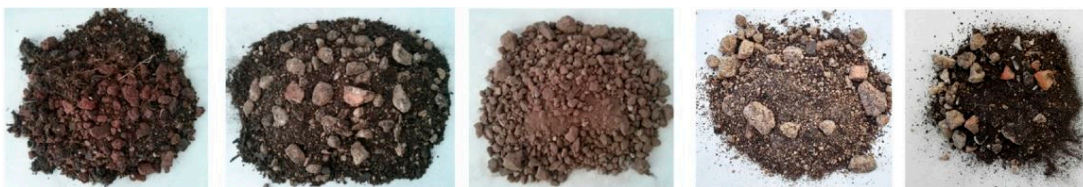
Figure 3. Commercial substrates analyzed by Coma et al. [56]

The common procedure is to blend various materials with different attributes at well-defined percentages to constitute the growth substrate. However, the substrate in green roofs differs from traditional garden soil, as traditional moulds are mainly composed of organic materials, such as peat and compost. The substrates consist mainly of mineral materials (Figure 3), varying from 50% to 90% of the substrate volume and giving the green roof a lower density, higher porosity (75%), higher draining capacity in saturated conditions, and easier ventilation of the roots. The most used low-density inorganic materials for the substrate are pumice, zeolite, scoria, vermiculite, perlite, peat, and crushed brick. In particular, the particle size should have a high percentage of granules with a diameter between 2–4 mm. Some researchers recommended the use of more than 80% inorganic materials in the composition of the growing medium and, thus, the load of green roofs can be lowered.