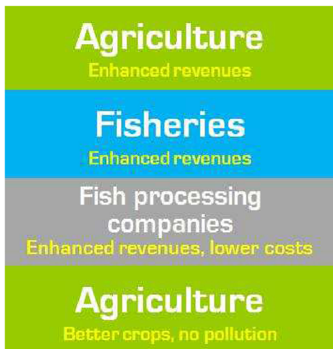
Scheme 1. The value chain actors involved in the production and utilization cycle of AnchoiFert.