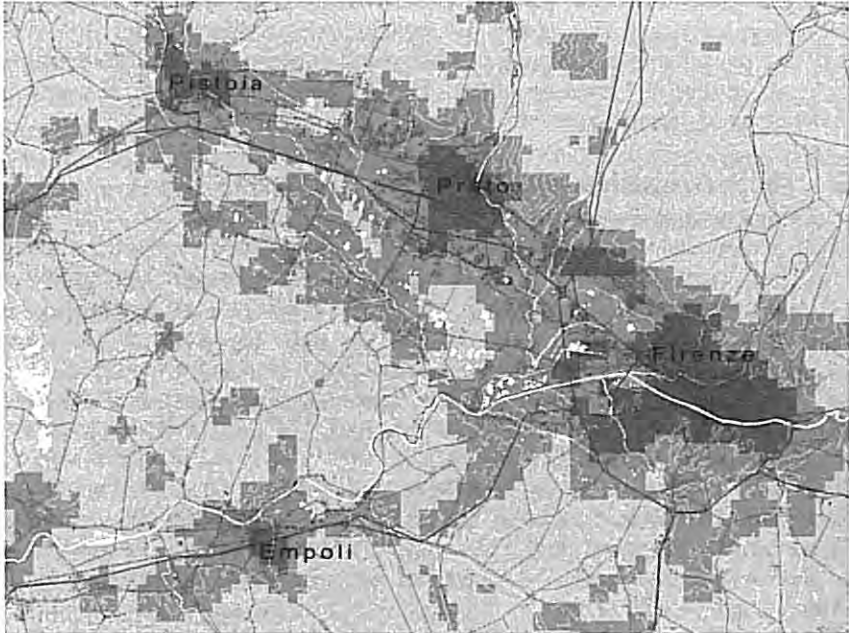
Figure 1: Geo-demographic organization of the metropolitan area of central Tuscany. Areas with high, medium and low intensity of activity on a working spring day.

Based on the distribution of the activity in different areas, known areas with given functions and settlements were identified and compared to each other through a diagram (Figure 2). About 45% of the overall activity was concentrated around the three main cities of Florence, Prato and Pistoia with different intensities.