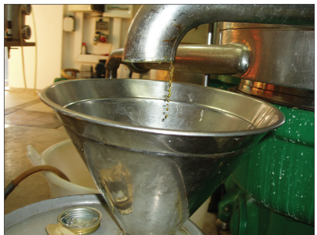
Fig 6. The bergamot essential oil is separated from water and impurities by means of a centrifuge.

of essential oils inhaled before sleeping was found to have a beneficial effect for patients in cardiac rehabilitation (McDonnell and Newcomb, 2019).