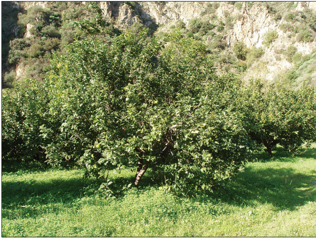
Fig 1. A bergamot tree ( Castagnaro cv ).