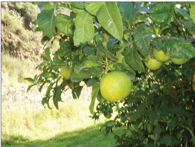
Fig 2. Leaves and fruits of a bergamot tree ( Castagnaro cv ).