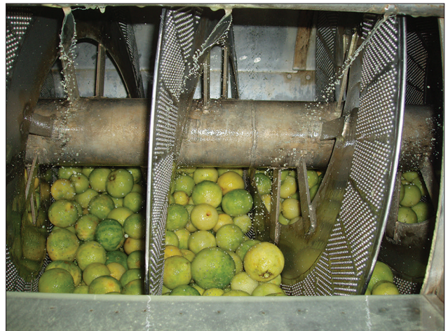
Fig 5. The peel of the bergamot fruits is scraped to extract the essential oil.