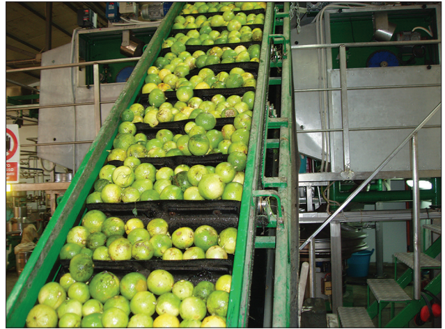
Fig 4. The bergamot fruits are loaded by the conveyor belt for the washing process.

activity against bacteria, fungi and larvae (Cirimi et al., 2016), neurobiological effects mainly for oxygenated compounds such as linalool and linalyl acetate (Bagetta et al., 2010), in aromatherapy is used to minimise the symptoms of cancer pain (Forlot and Pevet, 2012) moreover a mixture